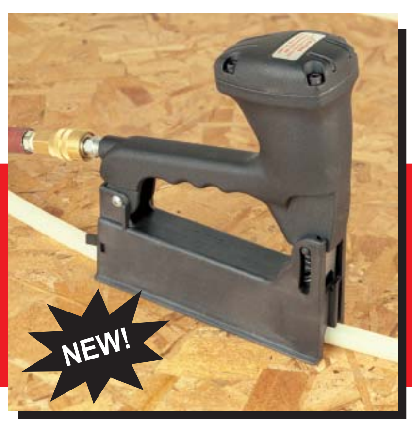
U.S. Patent 6,481,612. Foreign patents pending.