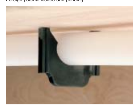
U.S. Patents 4,801,061 & 4,801,064 & 5,350,267. Foreign patents issued and pending.

RB Clip housings are manufactured of high-density polyethylene that is lightweight yet strong. Two galvanized nails per clip are driven 5/8" into the wooden surface, providing an installation that is both strong and permanent.